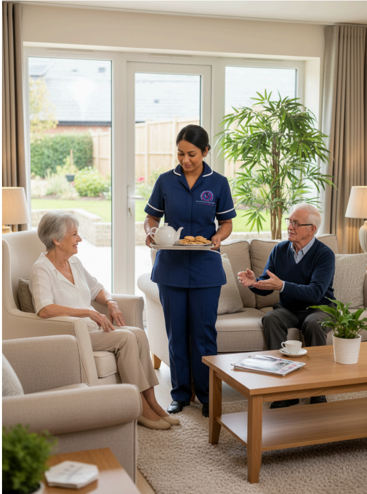
Service Range Guide

Verity Healthcare adopt a more efficient, integrated set of procedures managed by robust technology solution to implement holistic care services to meet a wide range of needs of clients.