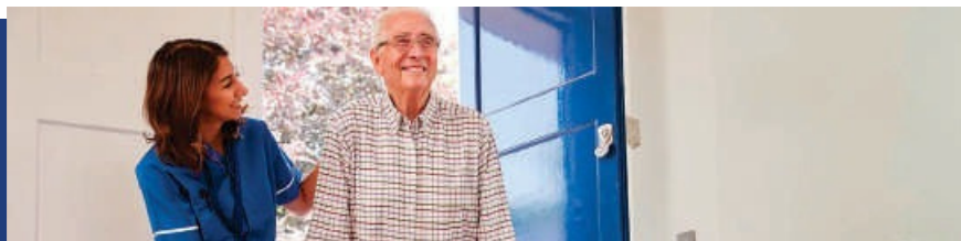
Service Range Guide

The nursing care initial assessment is intended to guarantee a level of transparency, clinical risk evaluation, and provide the basis for further training where necessary to help to meet the specific needs of each client. This assessment enables the nursing team to plan for post discharge rehabilitation plans, nutrition and physiotherapy. In addition, the nursing team are able to assess whether any additional mobility aids or adaptations are required for our client's home and liaise with social services for supplies and fitting.