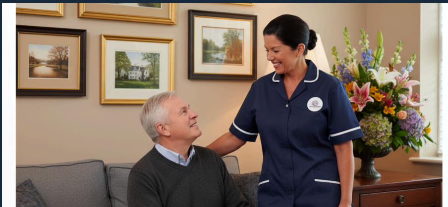
Service Range Guide

Services will be assured that they will be in the safe and capable hands of a team of friendly, dedicated, and experienced staff who provide exceptional care services. We become part of your family!