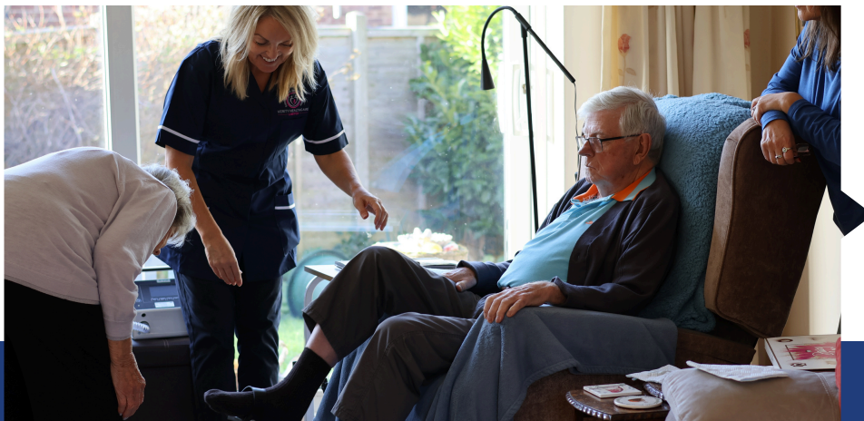
Service Range Guide

We know that time is of the essence to our clients. That's why we provide a quick turnaround service for all our clients. Our care managers and lead nurses are available to visit you speedily on your first contact with us to ensure that you understand our expertise in providing the care that you need.