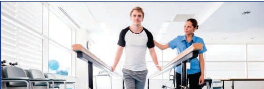
Service Range Guide