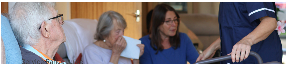
Service Range Guide

We have an exciting team of care staff to accompany you and/or your family to travel to other parts of the country or overseas. They are specially trained to understand how to manage emergency situation while on holiday.